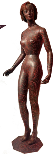
Title: Untitled (1965-66) Takahashi Ryutaro Collection

How are they feeling? What is their voice like?