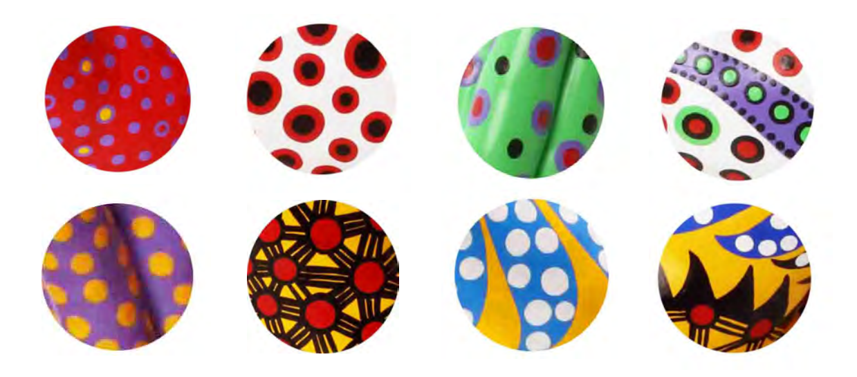
Find more patterns other than these? What patterns have you found?

Talk with your family and friends about your favorite patterns!