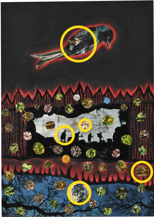
TITLE: Traversing Mountains (1993)

Different scenes are combined in this single artwork. This piece uses a technique called collage, where pictures are cut and pasted onto a surface. It seems like we are looking at a scene from a dream. Do you think this landscape comes from reality...? There are other collage works, too! Let's look for them!