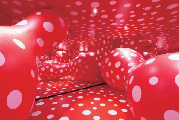
Dots Obsession (2015)

When an entire space is transformed into an artwork, it is called an installation.