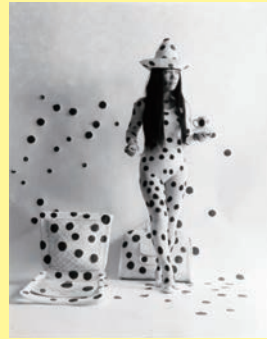
Self-Obliteration by Dots (1968)

Just like the drawing she drew when she was 10 years old!